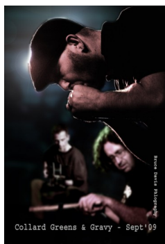
Collard Greens and Gravy @ WOW